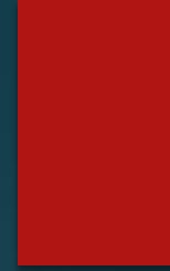
Institute Feedback -